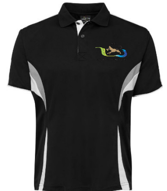
Black / White / Grey