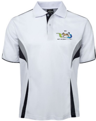
White / Navy / Grey